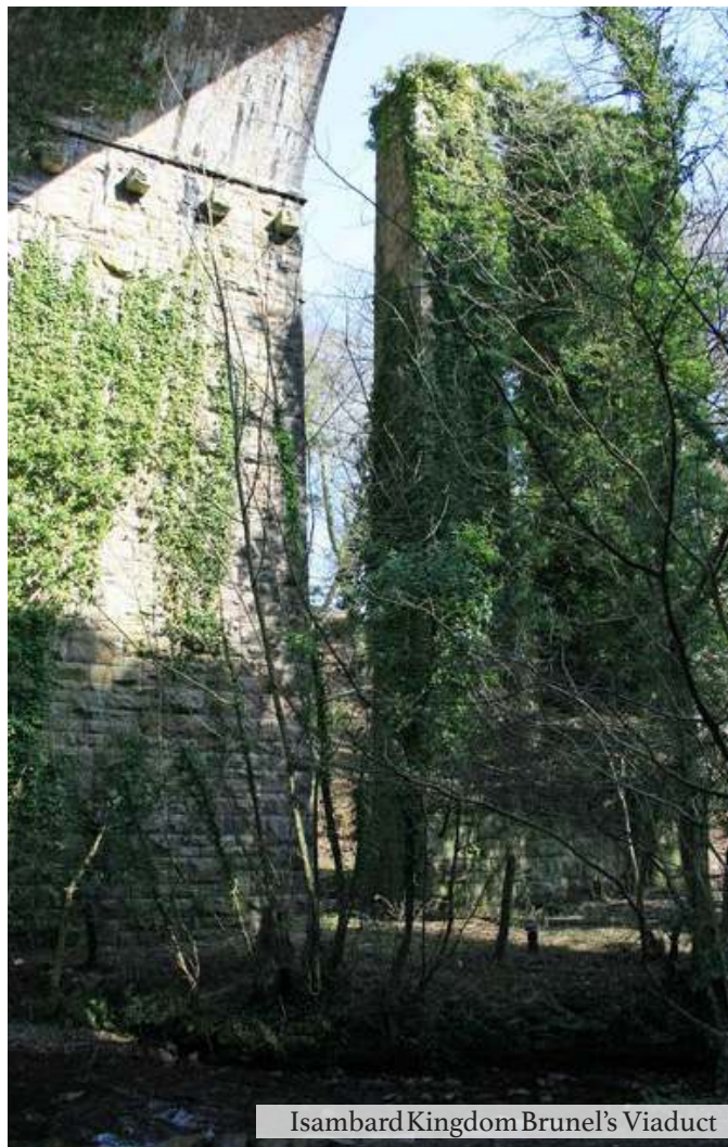
Isambard Kingdom Brunel's Viaduct

This walk is approximately 1.5 hours long and easy to do. Clear paths, hiking boots are not required.